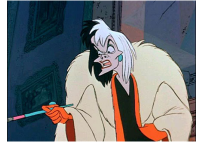
Cruella Da Ville GG, Ff, ss, Bb